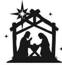
OH HOLY NIGHT!

12/24/15 Christmas Eve 4PM St. Joseph 5:30PM St. Mary MIDNIGHT St. Mary